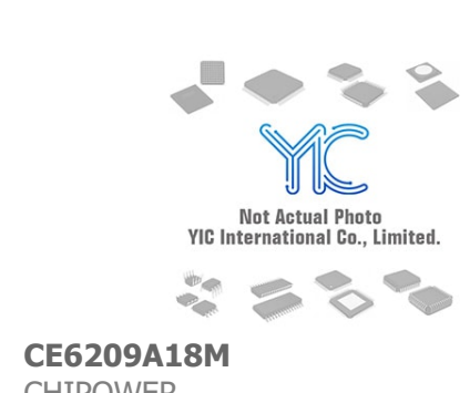
CHIPOWER CHIPOWER SOT-23-3