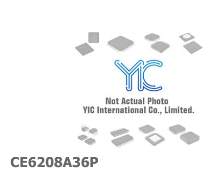
CHIPOWER CHIPOWER SOT89