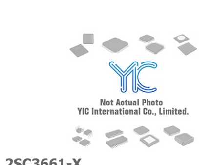
2SC3661-X SANYO SANYO SOT23