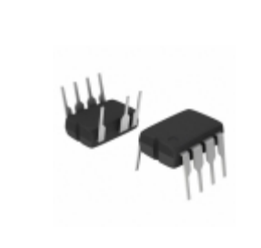
TOP244P Power Integrations IC OFFLINE SWIT OVP UVLO HV 8DIP