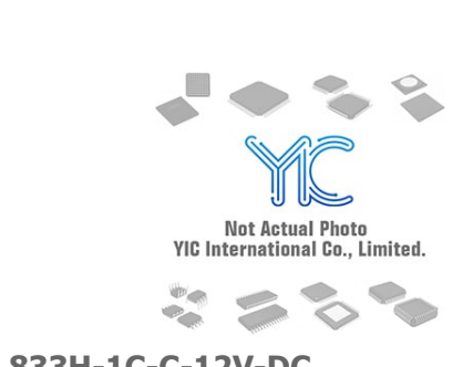
833H-1C-C-12V-DC SONGCHUAN 833H-1C-C-12V-DC SONGCHUAN