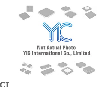
833FCI MICROCHI 833FCI MICROCHI