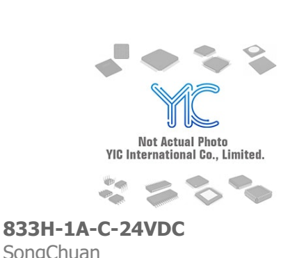
SongChuan 833H-1A-C-24VDC SongChuan