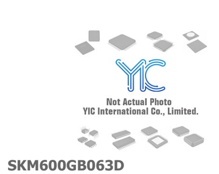
SEMIKRON IGBT Modules