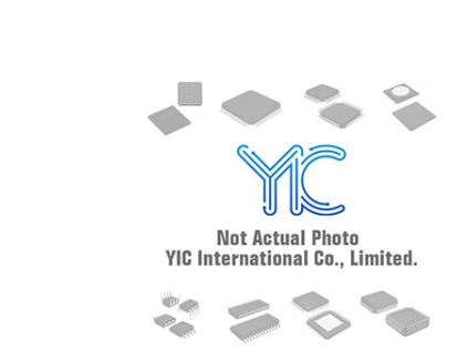
LR1108G-33-TN3-D-R UTC UTC TO-252