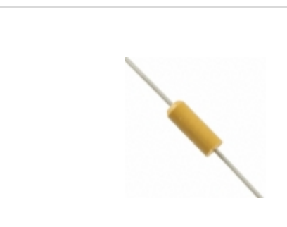
T322A334K035AS KEMET CAP TANT 0.33UF 35V 10% AXIAL