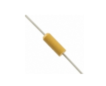
T322A335K006AS KEMET CAP TANT 3.3UF 6V 10% AXIAL