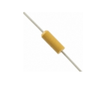
T322A225K010AS KEMET CAP TANT 2.2UF 10V 10% AXIAL