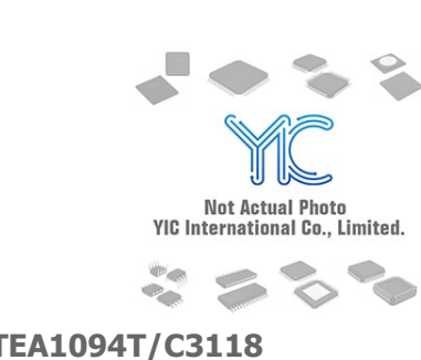
TEA1094T/C3118 PHILIPS PHILIPS SOP