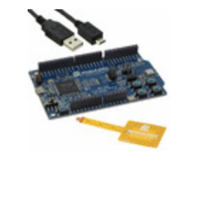
BMD-350-EVAL Rigado, Inc. EVAL BLE 4.2 NORDIC NRF52832