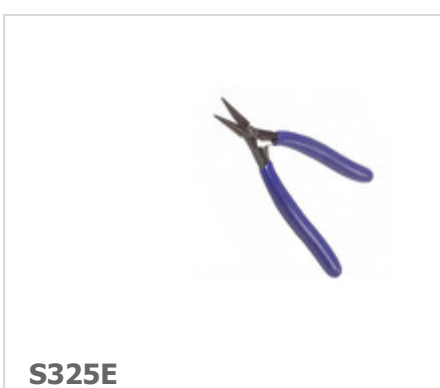
Swanstrom Tools PLIERS ELEC CHAIN NOSE 6.21"