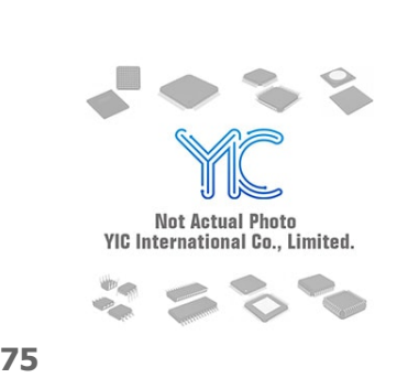
S3275 TOSHI S3275 TOSHI