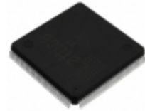
LFXP6C-5Q208C Lattice Semiconductor Corporation IC FPGA 142 I/O 208QFP