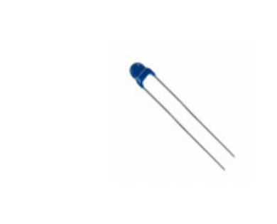
S05K150GS2 EPCOS (TDK) VARISTOR 240V 400A DISC 5MM