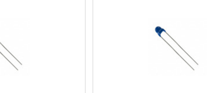
S05K150 EPCOS (TDK) VARISTOR 240V 400A DISC 5MM