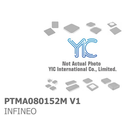
PTMA080152M V1 INFINEO PTMA080152M V1 INFINEO