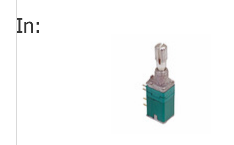
PTM902-820K-103B1 Bourns, Inc. POT 10K OHM 1/20W CARBON LINEAR