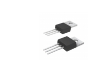
MCR68-2G Littelfuse Inc. THYRISTOR SCR 12A 50V TO220AB