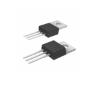
MCR68-002 ON Semiconductor THYRISTOR SCR 12A 50V TO220AB