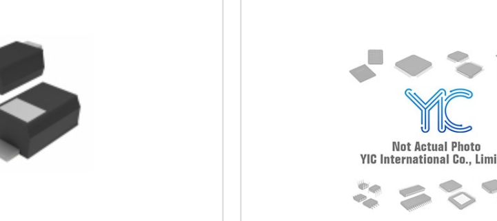
Micro Commercial Co DIODE GEN PURP 400V 1A SOD123FL