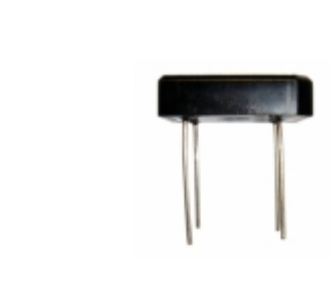
MB86 Micro Commercial Co RECTIFIER BRIDGE 8A 600V BR-6