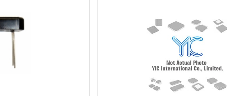
MB86029 FUJ MB86029 FUJ