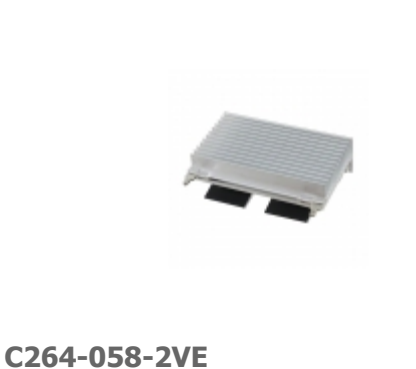
Ohmite HEATSINK AND CLIPS FOR 2 TO-