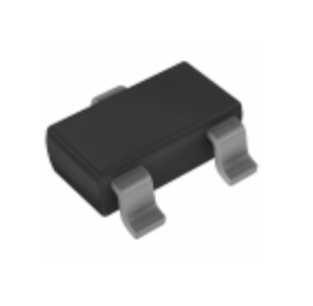
BAT750TA Diodes Incorporated DIODE SCHOTTKY 40V 750MA SOT23-3