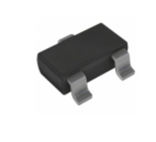
BAT750-7-F Diodes Incorporated DIODE SCHOTTKY 40V 750MA SOT23-3