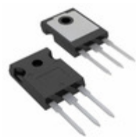
IRFP048NPBF Infineon Technologies MOSFET N-CH 55V 64A TO-247AC