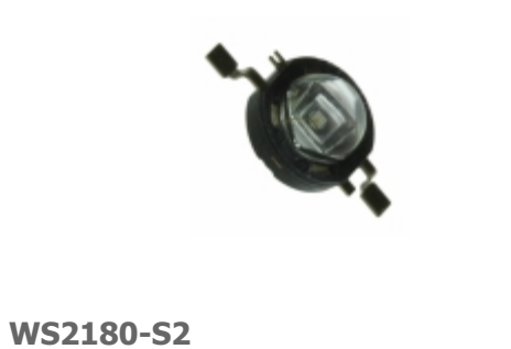
Seoul Semiconductor Inc. LED ZPOWER COOL WHITE 6375K SMD