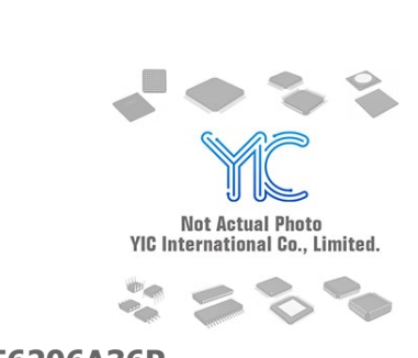
CE6206A36P CHIPOWER CHIPOWER SOT-89