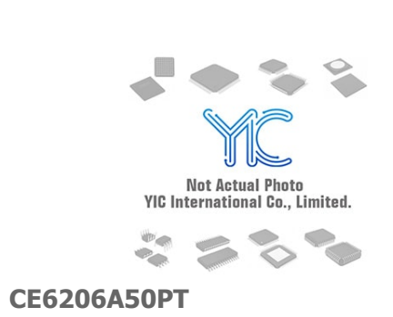
CHIPOWER CHIPOWER SOT-89