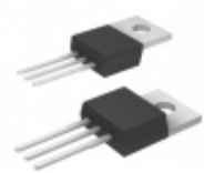
CS5206-1GT3 ON Semiconductor IC REG LDO ADJ 6A TO220AB