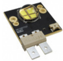
CSM-360-WDLS-D22-GX150 Luminus Devices Inc. BIG CHIP LED HB MOD WHITE 3600LM