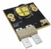
CSM-360-WWRM-D22-GS750 Luminus Devices Inc. BIG CHIP LED HB MOD WHITE 1750LM