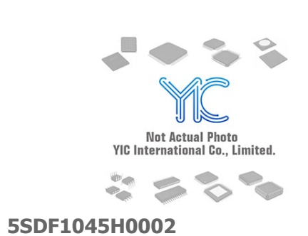
ABB IGBT Modules