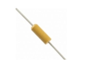
T322A155K015AS KEMET CAP TANT 1.5UF 15V 10% AXIAL