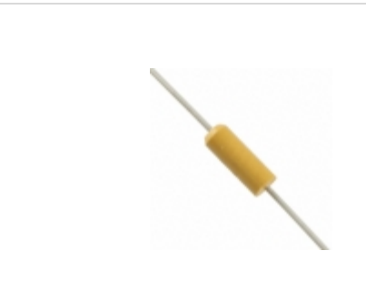
T322A224K050AS KEMET CAP TANT 0.22UF 50V 10% AXIAL