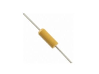
T322A155K015AT KEMET CAP TANT 1.5UF 15V 10% AXIAL