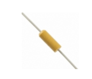
T322A224K035AT KEMET CAP TANT 0.22UF 35V 10% AXIAL