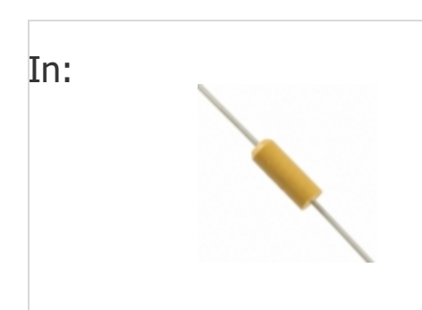
T322A224K035AS KEMET CAP TANT 0.22UF 35V 10% AXIAL