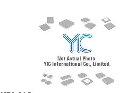
KBL410 SEP SEP DIP-4