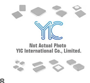
KBL408 SEP KBL