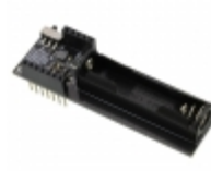
RFD22127 RF Digital RFDUINO SINGLE AAA SHIELD