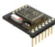
RFD21813 RF Digital Corporation RF TXRX MODULE ISM>1GHZ CHIP ANT