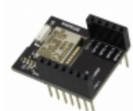
RFD22102 RF Digital Corporation RF TXRX MOD BLUETOOTH CHIP ANT