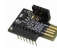
RFD22124 RF Digital RFDUINO PCB USB SHIELD