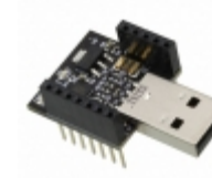
RFD22121 RF Digital RFDUINO USB SHIELD