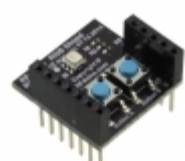
RFD22122 RF Digital RFDUINO RGB SHIELD