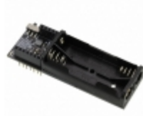
RFD22126 RF Digital RFDUINO DUAL AAA SHIELD