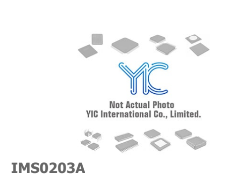
TDK IMS0203A TDK