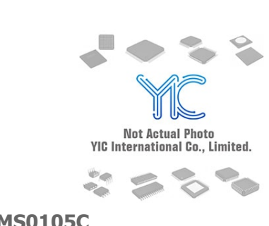
IMS0105C IMTECH IMTECH SMD