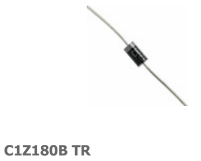
Central Semiconductor Corp DIODE ZENER 180V 1W DO41