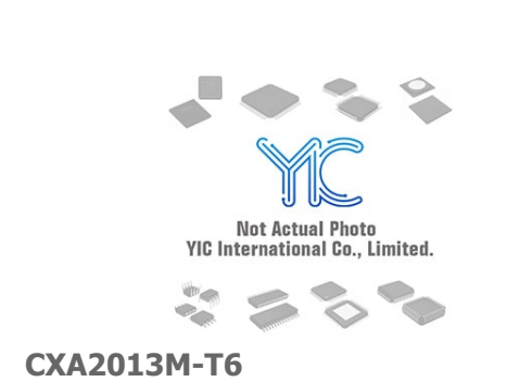
SONY CXA2013M-T6 SONY