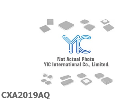
SONY CXA2019AQ SONY