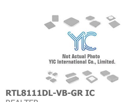
REALTER REALTER QFP48