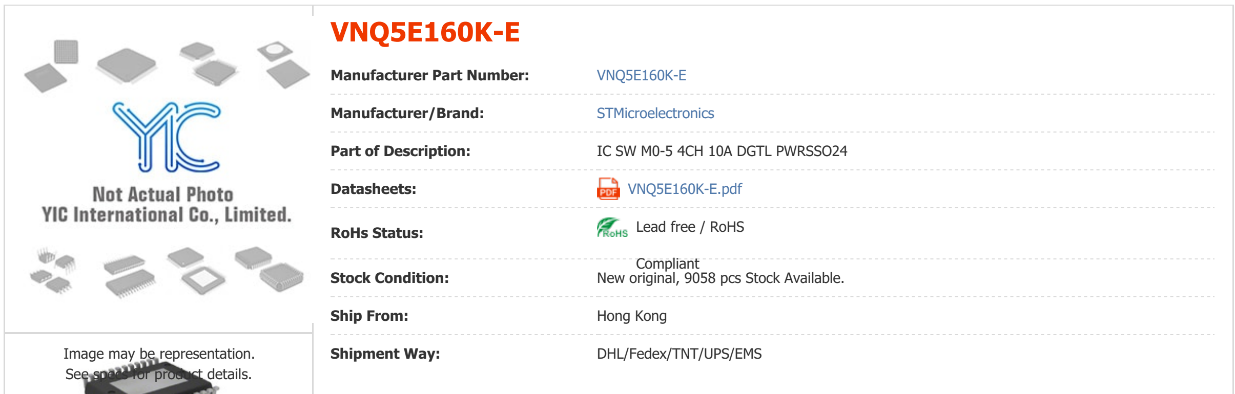
Image may be representation. See specification for product details.