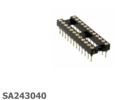
On Shore Technology Inc. CONN IC DIP SOCKET 24POS GOLD