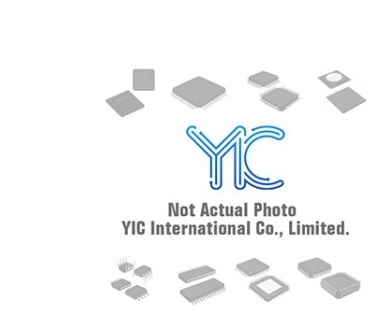
SKM50GDL062D IGBT Module IGBT Modules