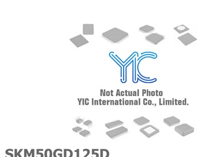
SKM50GD125D SEMIKRO IGBT Modules