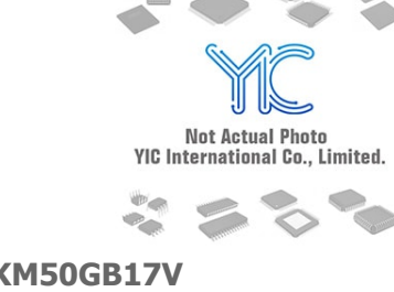
SKM50GB17V SEMIKRON IGBT Modules